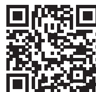
Give to APC